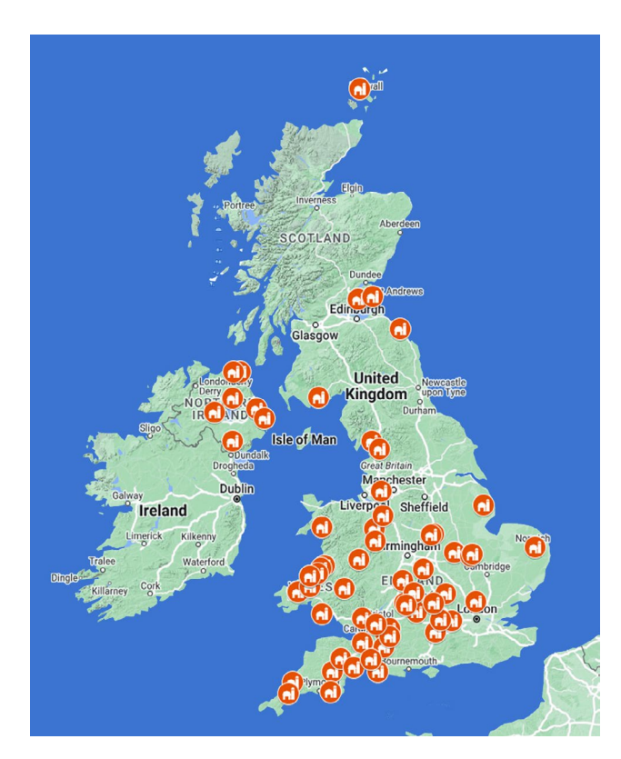
Map Farmers and growers who agreed to take part in the project came from most areas of the UK

We are actively trying to recruit more participants for the next set of workshops.